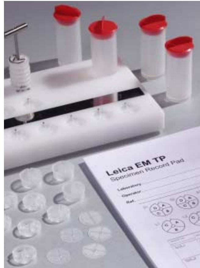
Loading plate and consumable