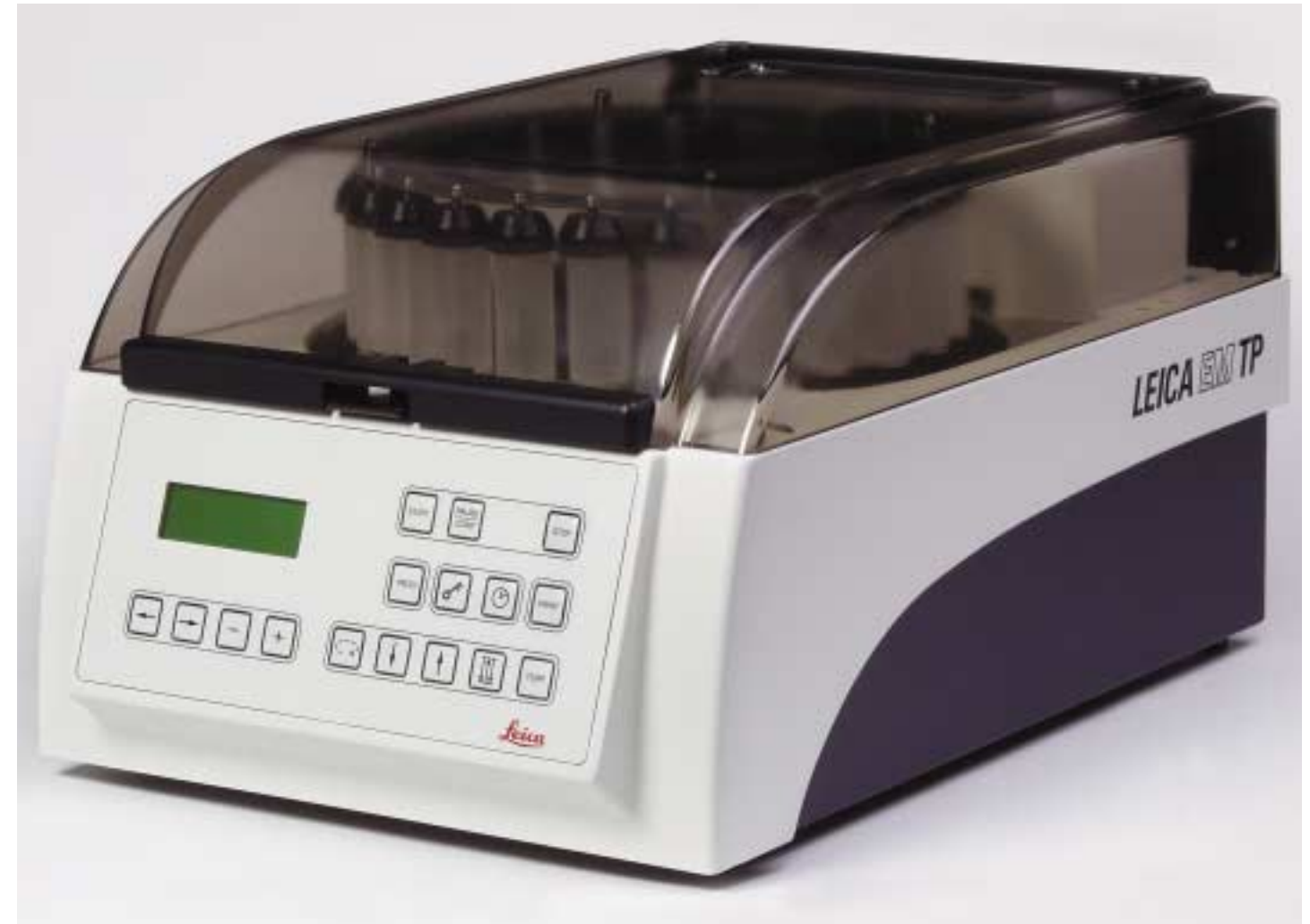
Designed by Werner Hölbl

The latest technology is used for interfacing user and instrument. A simple to use control panel allows data storage of up to 99 programmes, all of which can be named. Reagents can be selected from a reagent list which can be customised by the user. If a mistake is made during programming or selection of a field then the EM TP gives an audible warning and shows on the screen what the error means. Processing can be started immediately or with delay. Programming can also be carried out while the instrument is processing.