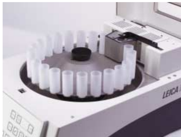
Processing of EM samples