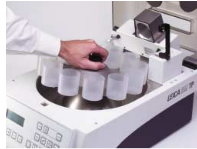
Moveable H/C unit for safe and easy access of carousel

12, 100ml vials can be twist fitted to the carousel for processing large samples or high volume of specimens into resin. The EM TP has a holder for standard histology cassettes thus allowing very large specimens such as bone to be decalcified and processed. CellSafe holders can also be used for processing.