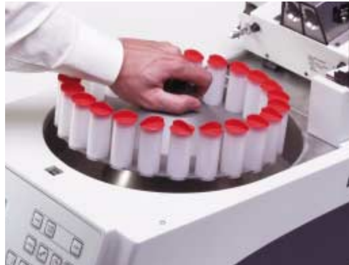
H/C unit shown in loading position for safe and convenient access

Reagents can be pre-loaded into the vials attached to the carousel in a fume cupboard. Toxic reagents can be sealed with individual vial caps before taking them over to the EM TP. The heater/cooler (H/C) unit flips back allowing direct access of the carousel to the processing area. The H/C unit has pre-heat and pre-cool thus allowing reagents to be at the correct temperature before coming into contact with the tissue.