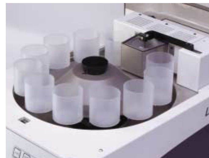
Processing of LM samples